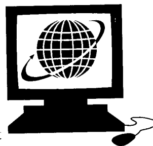
Automatic updates from the RMCDS FTP Site now available.

scape and download the files first. Choose this option and it will get the files off the FTP site and automatically run the revision right after. You will first need to update your pro-